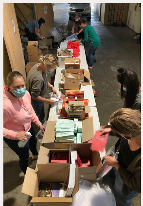
Volunteers helping to pack care packages